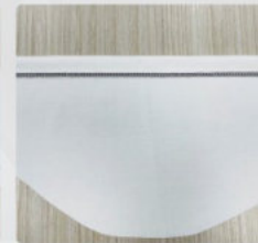
实际效果 Actual effect