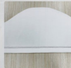
实际效果 Actual effect