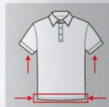
下摆，袖口工艺图 Hem, cuff process drawing

Jersey, Pique and Lycra Open Single piece body or sleeve hem or other shirt. Bottom hemmer.