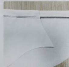
实际效果 Actual effect