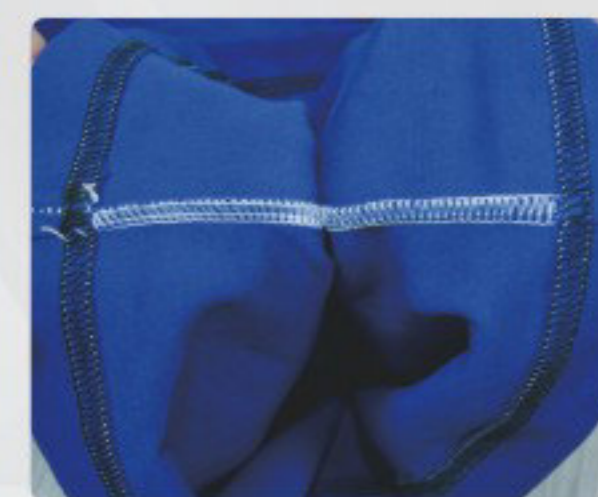
实际效果 Actual effect