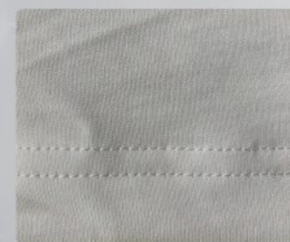
实际效果 Actual effect