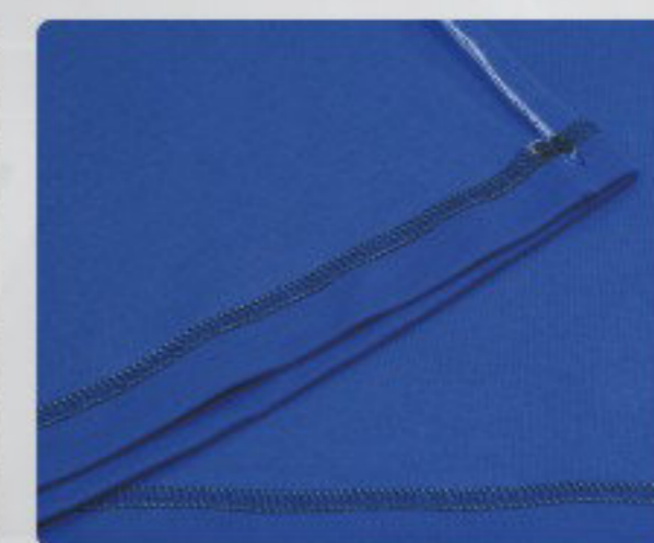
实际效果 Actual effect